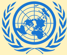
The United Nations (UN)

Choose ONE of the international organisations given below and write a paragraph (120-150 words) about benefits of Viet Nam as a member of it. Then post it on the LMS Discussion.